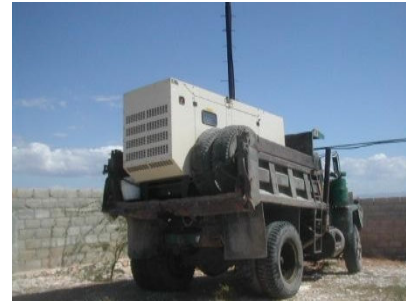
Generator just prior to unloading.