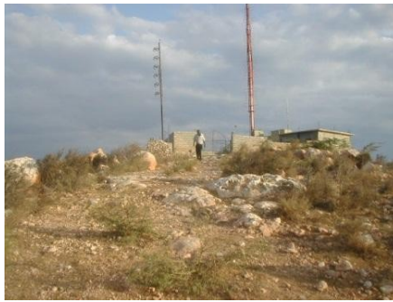
FM antenna, left. TV antenna, right. Access road, foreground.

It's kind of hard to see the little cameras (below) but the cables are visible to three of them. The right picture is the control- and monitor-set for the cameras, also from Back to the Bible.