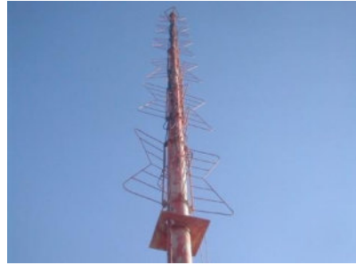
Closeup of the TV antenna.

There is still some work to do. One of the lines has some kinks and will have to be replaced. We had hoped to seal all the bare aluminum on the new lines to prevent corrosion but the silicone was bad. As you can see from the picture it needs a new coat of paint. It's galvanized but a paint job would really help.