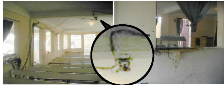
Left: Camera locations w/closeup. Right: Control and monitor set.

(February Haiti Trip to be concluded next month.)