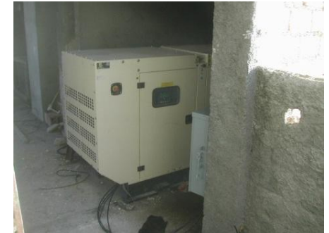
Generator finally in place and hooked up.