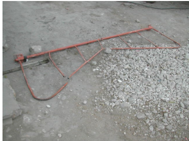
Repaired batwing at welders.

On my return to Omaha I called a friend of mine who had his own tower maintenance company, Omaha Telecom. I asked him if he would like a couple of weeks in Haiti to inspect a TV antenna and tower for a mission. He said "yes" and I booked the flight. He also brought along some tower climbing gear that could be left for future work. He is a very resourceful guy, just what is needed down there. He did a complete inspection and found several things needing mostly minor repairs. There was a cracked weld on one of the batwing elements. He took it down and we took it into town for straightening and rewelding. One of the lines was damaged, probably when it was installed, so we changed it out. I did have enough spare line for the replacement.