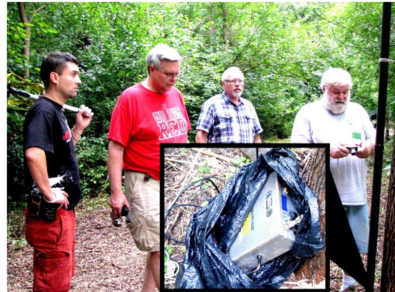
Rabbit hunters and the rabbit at the OPPD Arboretum. Left-to-right: KEØBHP (1st to find it), NØMNV (2nd), WBØGBI (3rd), and NØJSB, who hid the rabbit.