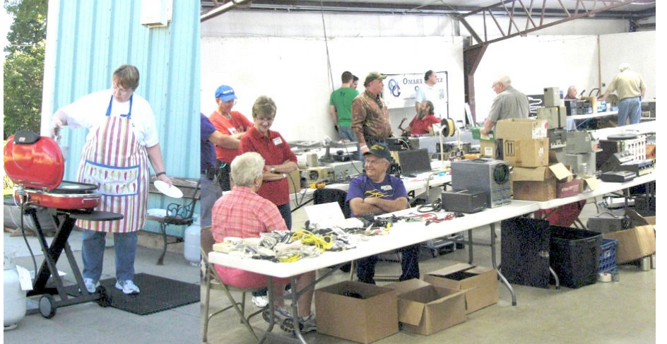
AARC Flea-esta, 2014