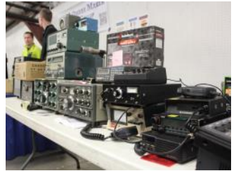
Flea -Está 2015