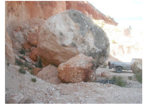
Marble boulder at the quarry. Note the truck next to it.

After I got home I got to thinking; there should be an electrical supply store in the Rivera Beach area. I googled it and there was. They also do local deliveries free. I ordered what was stolen and had it delivered to Teeters. We also have a 20 foot container with the quarry equipment waiting for shipment. Teeters called me and asked if they should put it in the container since there was room. YES! Our electrical supplies will get to Haiti at no cost.