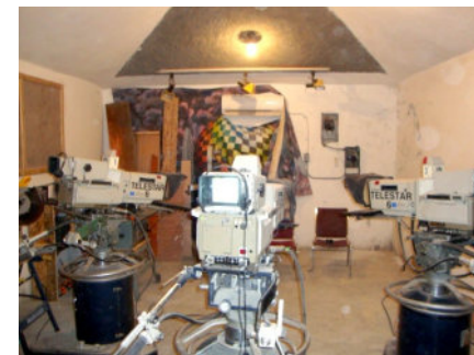
Three new cameras from KETV, Omaha and the new electrical on the far wall.

After breakfast we went to the mountain to get some of the electrical materials sent by the Canadians. Revenel had put it up there for safe keeping. When we got there it was gone along with every bit of spare copper line, five spare tubes for the old transmitter (about $920 ea.), some spare light bulbs, and other small stuff. There was also a hub taken from the new electrical service equipment. If we had to replace what was stolen, it would be over $20,000. Fortunately most of it was spare parts except the electrical stuff. A dozen fluorescent lamp fixtures for lighting in the studio and sanctuary and a 10 foot, 2" piece of pipe with a weather head for the new city power hook up.