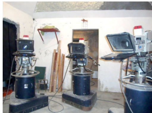
Three new cameras.

One day we went to the church at Jubilee and Kevin put in four lights with conduit, and an outlet with a