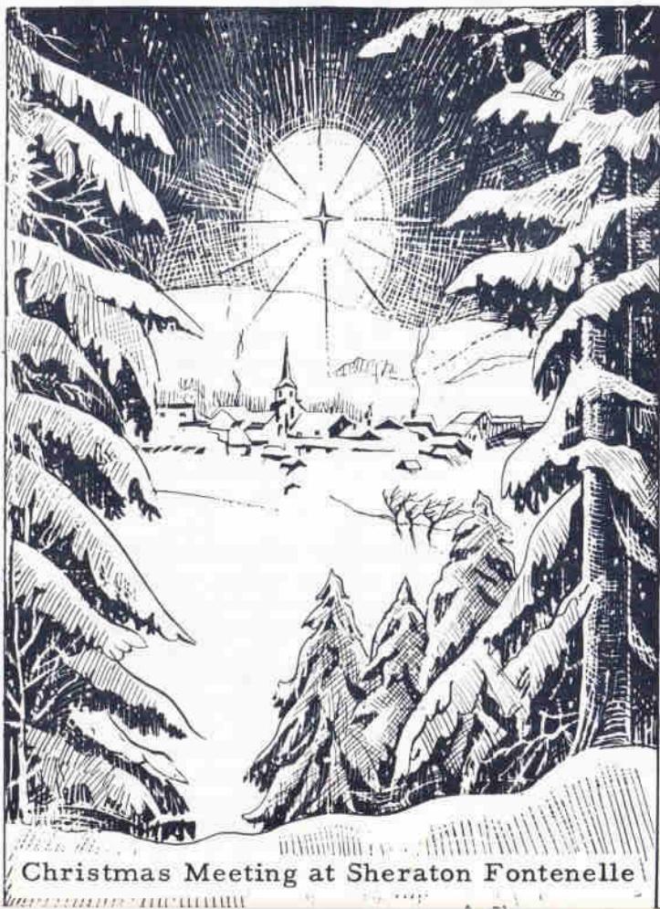
Christmas Meeting at Sheraton Fontenelle