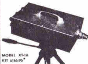
MODEL XF-1A KIT $116.95*

* Factory-direct price for customers ordering direct from us within two weeks after receiving the CCTV catalog. REGULAR PRICE: $124.95. Videos not priced in kit. Available separately for $8. Postpaid.