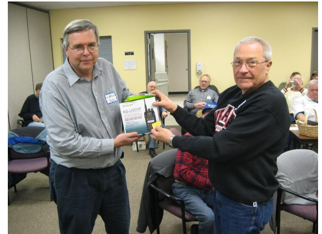
NØMNW (left) accepts the KG-UVDIP from ABØNN.