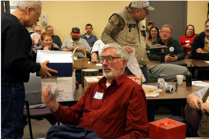
Nearly 40 people attended the December meeting.