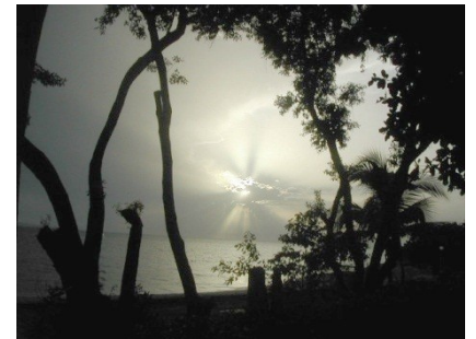
Sunset after storm on Kaliko Beach.

Next report in December or January if all goes well.