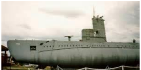
USS Marlin SST-2