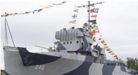
USS Hazzard AM-240