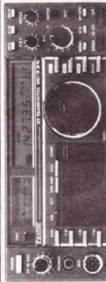
HF Transceiver/General Coverage Receiver

IN STOCK — AVAILABLE FOR IMMEDIATE DELIVERY!!