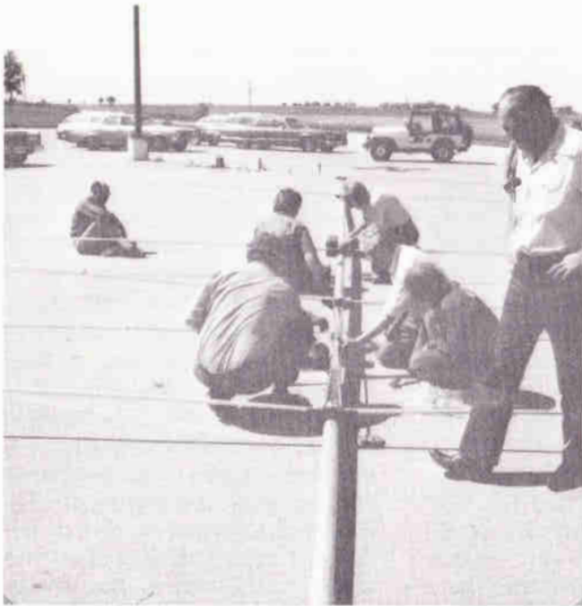
ON SEPTEMBER 10, 1977 AT JCC ANTENNA PARTY