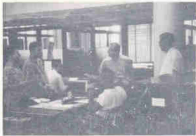
"Ham Hum Workers in Session"