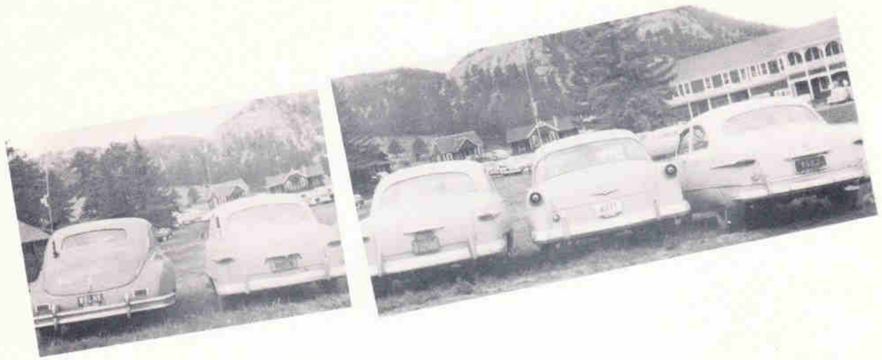
Estes Park, Colo. of the six, "Call Letter License Plate" States, represented, here are five. Note: All are individual plates except Nebraska. They are Left to Right, Ohio, Missouri, Nebraska, Kansas and California.