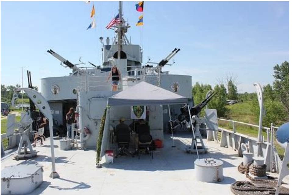
They can be seen below on the Fantail (Rear or Stern of the ships main deck) in the shade of their canopy.